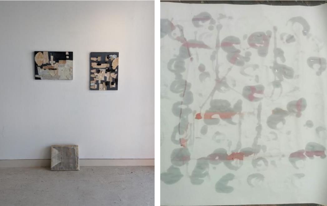
Line Work #21