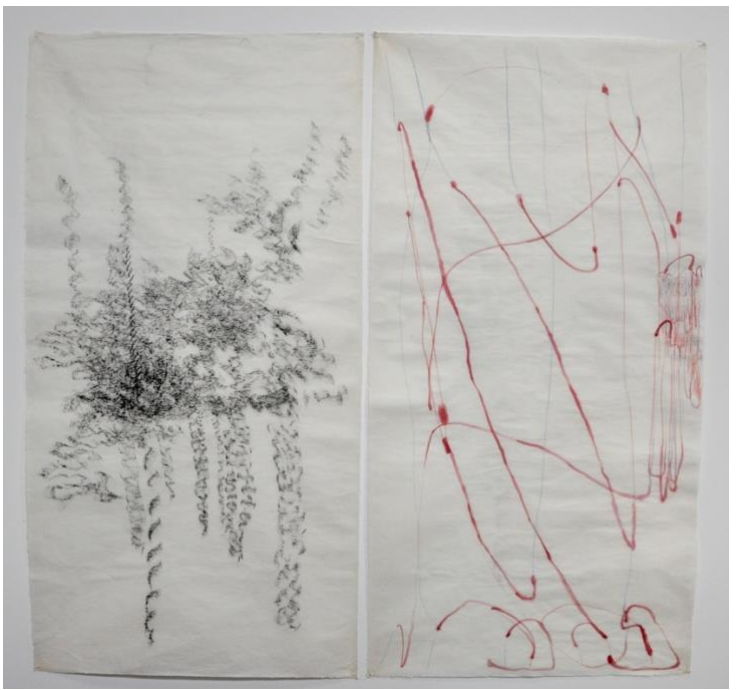
Line Work #5