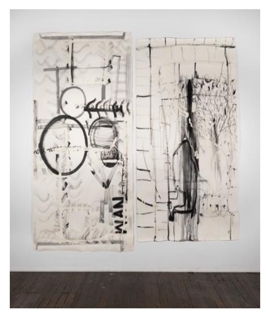
Line Work # 27

At this stage, we were exploring drawing as a way of mapping, walking and movement. The specific prompt for Line Work #27 was a series of walks taken near our Marrickville studios. We recorded our memories of those walks on the twin sheets of paper – using layers of masking fluid and ink – while repeatedly swapping the sheets between us. Finally, we removed all the masking fluid and the sum of our shared experience was revealed.