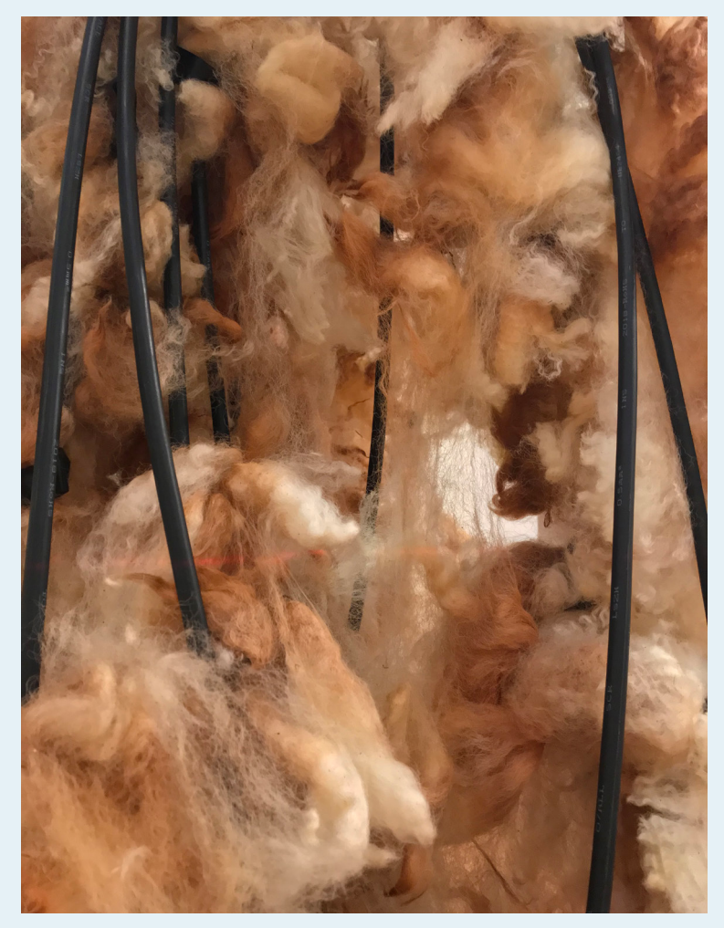
Sue and Peg Pedley, Patches of Light (detail), 2019, wool, power cord, tape

Taken together, the materials of this exhibition are varied (and sometimes smelly to boot): sheep's wool from Deloraine; seaweed from Low Head; electrical cord; annealed wire; old bags of various shapes and sizes, some for wool, some for sand, in hessian and synthetic cloth; scraps of dress fabric. They recall locations and activities beyond the gallery home, farm, workshop, garden, beach – and speak of past uses and past lives. Like the repurposed wool bag, they frequently relate to a family story or experience. For instance, Low Head at the mouth of the Tamar River, where the seaweed was gathered, is a significant spot for both sides of the family. It saw the arrival of William Field, Sue's convict forebear, and his wife Elizabeth Robley to the colony. Peggy's sea-captain grandfather regularly sailed up and down the Tamar on his way between Melbourne and Launceston. Peggy holidayed at Low Head as a child and later with her own children.