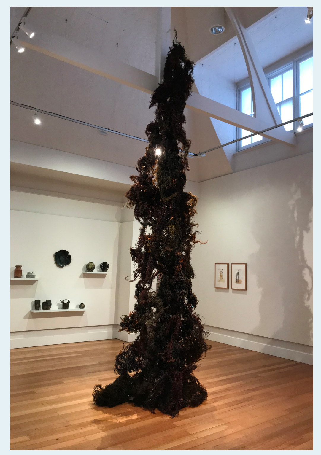
Sue and Peg Pedley, Patches of Light, installation detail at QVMAG, Launceston 2019